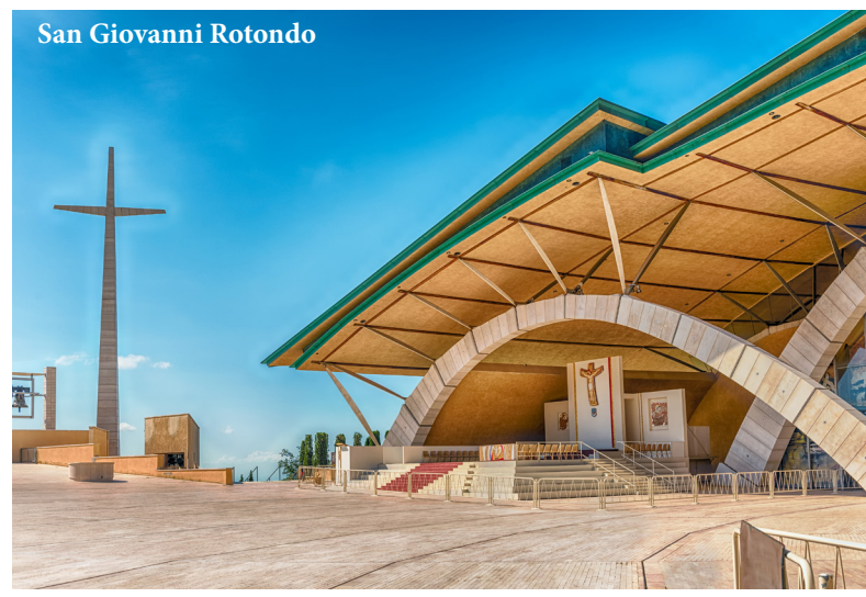
San Giovanni Rotondo